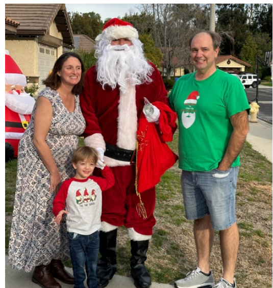
Family picture to celebrate!