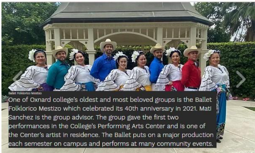
Ballet Folklórico Mestizo