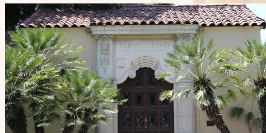
Diana Fowler's Story