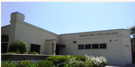
Pam Orren's Story